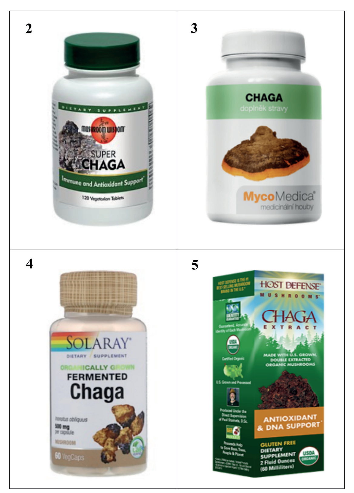
Figs. 2–5. Different products containing Chaga. 2. Inonotus obliquus tablets supplement (https://www.vitaminshoppe.com), 3. I. obliquus supplement capsules (www.mycomedica.eu), 4. I. obliquus fermented (www.kz.iherb.com), 5. I. obliquus extract (www.emersonecologics.com).